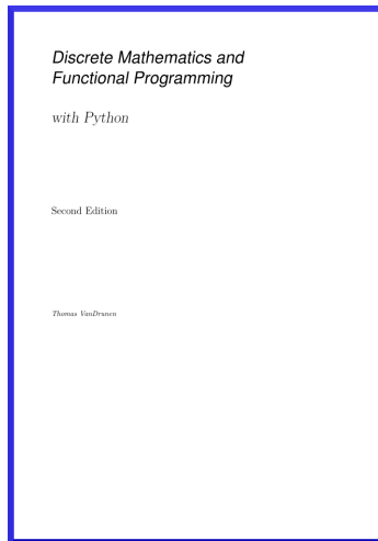
Discrete Mathematics and Functional Programming with Python. Under contract with Taylor & Francis. Expected 2026.