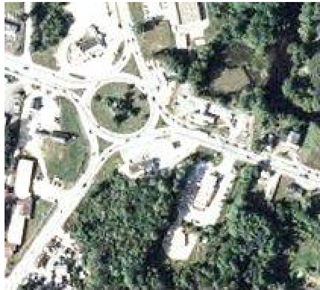
Images from Google Maps.