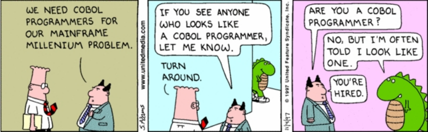
Scott Adams, 1997